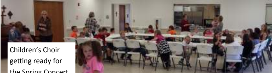
Children's Choir getting ready for the Spring Concert