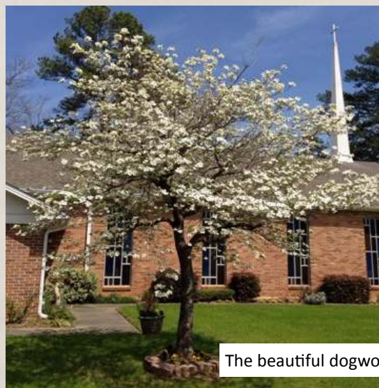
The beautiful dogwood tree at DeKalb FUMC

Are you an adult, age 18 or older? Would you be willing to serve as a Summer Camp counselor at Lakeview Methodist Camp the week of June 30-July 5? Contact the church office, Paul, or Breanna for more information.