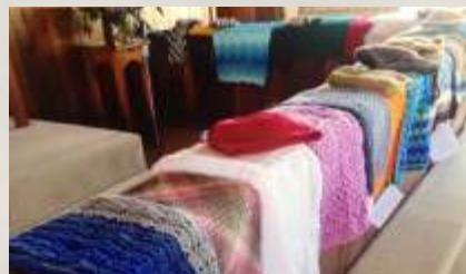
Blessing of the Piecemakers' Prayer Shawls, March 24