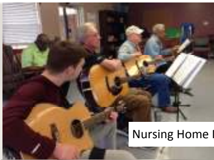
Nursing Home Ministry at the Ponderosa